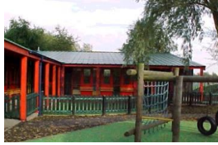
Monkchester Road Nursery